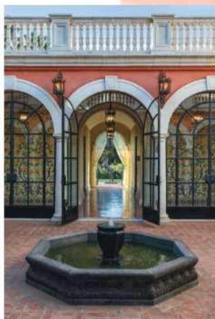
Clockwise from top left: Prancing Horse Estate's in-kitchen dining area opens via 13 custom iron-framed glass doors; the home's infinity pool and spa overlook the lake, gardens and vineyards; 2709 Vista Oceano Lane's arch-topped French doors open to reveal its romantic patios and lush gardens.

Nestled on 12 ½ perfectly manicured acres, this seven-bedroom, 11,000-square-foot oasis, affectionately named Prancing Horse Estate, spares no luxury. Designed by noted Santa Barbara architect Don Nulty, the Tuscan-inspired architecture is infused with classical design elements geared toward a modern lifestyle. Highlights include custom steel-framed glass doors and handmade coffered ceilings in the living room; the in-kitchen dining area's 13 custom iron-framed glass doors; and details like beautiful mosaic tiles in the water bathroom. The sprawling compound also offers homeowners the quintessential indoor-outdoor coastal lifestyle via numerous verandas, a