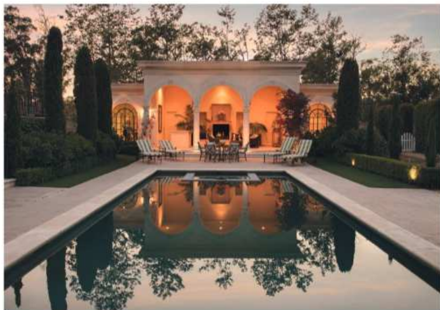
2709 VISTA OCEANO LANE PHOTO BY JIM BARTSCH; 6858 CASITAS PASS PHOTOS BY JIM BARTSCH

A seamless marriage of modern sophistication and timeless grandeur, Tuseany Oaks Farm sits high above the Pacific on 18 bluff-top acres. A private tree-lined drive uncovers the abode's captivating entrance galleria, revealing sweeping interiors, arch-topped French doors—which open to romantic patios and gardens—exquisite columns and more. As you venture inside the Don Nulty-designed space, elevated interiors meet you at every corner—from the French country-style kitchen with exposed wood beams to the refined wood-paneled library to the expansive veranda overlooking the rolling hillsides in the distance. Each room in the over 11,000-square-foot residence boasts handselected, custom finishes imported from France and Italy. The multifaceted estate—perfect for equestrian, art and car collectors—also serves as the optimal entertaining hub for both small or large-scale gatherings, thanks to a specially designed space located off the great room, not to mention the resort-caliber swimming pool, loggia pavilion and luxe cabana. To top it off, the Summerland compound showcases breathtaking panoramic views stretching from the mountains to the Channel Islands, Santa Barbara and Malibu. $19.8 million, listed by Mauricio Umansky, Eric Haskell and Eduardo Umansky, The Agency, theagency.com ♦